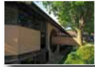
CRYSTAL HEIGHTS Columbia, MD