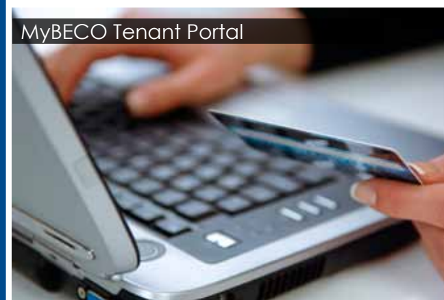
MyBECO Tenant Portal