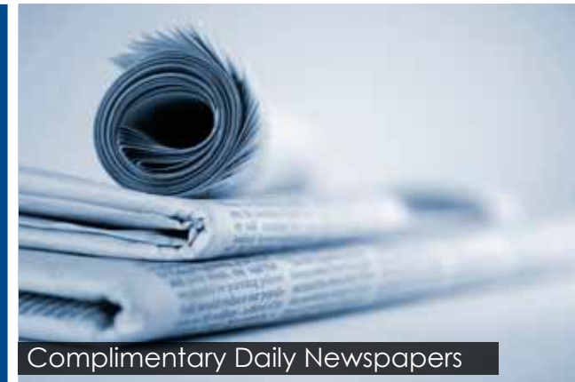
Complimentary Daily Newspapers