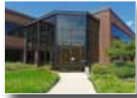
BECO PARK Lanham, MD