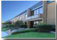
AIRPORT INVESTMENT Linthicum, MD

With offices in Maryland, Northern Virginia & Charlotte, North Carolina, BECO is positioned to provide you with our first class services and amenities in multiple locations.