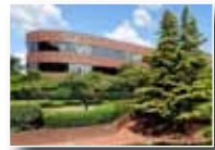
WASHINGTON BUSINESS PARK Lanham, MD