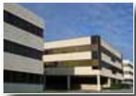
SECURITY OFFICE PARK Baltimore, MD