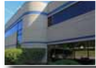
DORSEY BUSINESS CENTER I & III Elkridge, MD