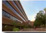
HALLMARK BUILDING Herndon, VA