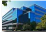
POPLAR RUN Alexandria, VA