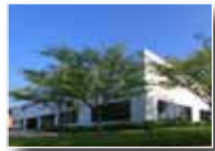
SOUTHGATE BUSINESS CENTER Chantilly, VA