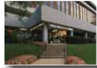
BECO BUILDING Rockville, MD