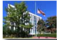
INTERNATIONAL TOWER BUILDING Linthicum, MD