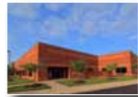
THREE PONDS BUSINESS PARK Columbia, MD