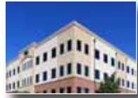
AIRPORT OVERLOOK Linthicum, MD