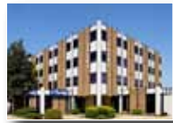
WHITE OAK Silver Spring, MD

EXPLORE THE OPPORTUNITIES & GROW WITH BECO MANAGEMENT.