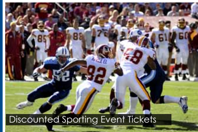
Discounted Sporting Event Tickets