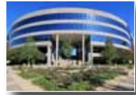
FIFTY WEST Fairfax, VA