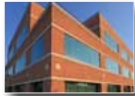
HERNDON SQUARE Herndon, VA