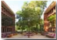
CENTURY PLAZA Columbia, MD