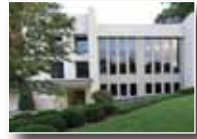
BECO WEST Rockville, MD