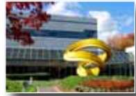
INNOVATION PARK Charlotte, NC