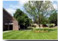
MONTGOMERY VILLAGE Gaithersburg, MD